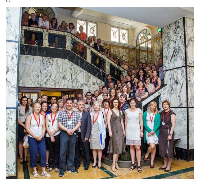
ELGPN family photo from the 15^{th} Plenary Meeting and 5^{th} Policy Review Meeting held in Zagreb, Croatia.

The Plenary Meeting discussed the structure of the forthcoming European Guidelines for Lifelong Guidance Policies and Systems Development and the main elements of the ELGPN 2015 Work Programme. The Policy Review Clusters also met to review and discuss progress made in the member countries in the implementation of the Work Programme.