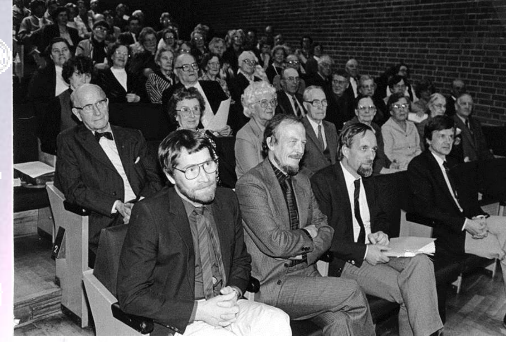
U3A lectures have been very popular from the very beginning

(Picture: Ending the spring term 7.5.1986)