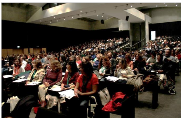
More than 550 careers professionals took part in the Portuguese national seminar in October 2013