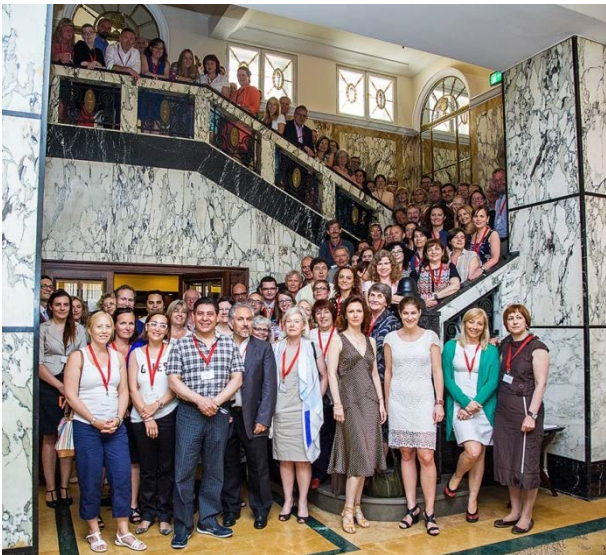
ELGPN family photo from the 15 th Plenary Meeting and 5 th Policy Review Meeting held in Zagreb, Croatia.

The Plenary Meeting discussed the structure of the forthcoming European Guidelines for Lifelong Guidance Policies and Systems Development and the main elements of the ELGPN 2015 Work Programme. The Policy Review Clusters also met to review and discuss progress made in the member countries in the implementation of the Work Programme.