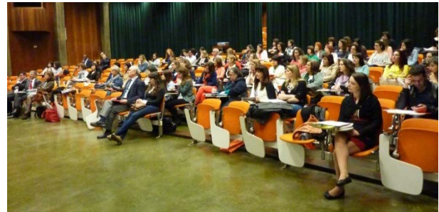
The Portuguese school psychologists gathered for an anniversary conference in Coimbra in April 2014.

The third goal of the conference was to bring together researchers (working mainly at the higher education level) and the professionals working in basic and secondary education, in order to foster the quality of school interventions and their articulation with the professionals' training and supervision.